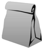
PAPER SACK LUNCH